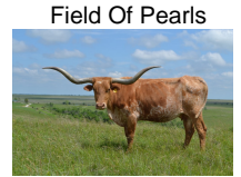
Field Of Pearls