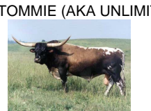
VJ TOMMIE (AKA UNLIMITED)