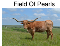
Field Of Pearls