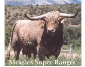
MEASLES' SUPER RANGER